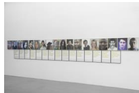
Texte: Handsiebdruck auf Glas, Goldlack, Barytpapier, Messingrahmen Portraits: Tinte, Barytpapier, Glas, Aluminiumrahmen, 104 x 900 cm