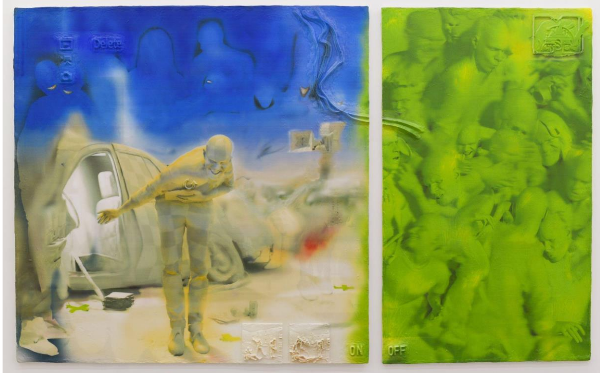
Simon Lehner, Safe Crash - revised . Acrylic on unique foam plate, lens based CNC Painting. 200 x 320 x 10 (2023). Credits: Simon Lehner, Galerie KOW