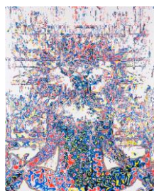
Martin Groß, SIRI. (Industry Painter on paper, 185,0 x 150,0 (2018) © Martin Groß, courtesy Galerie Eigen + Art