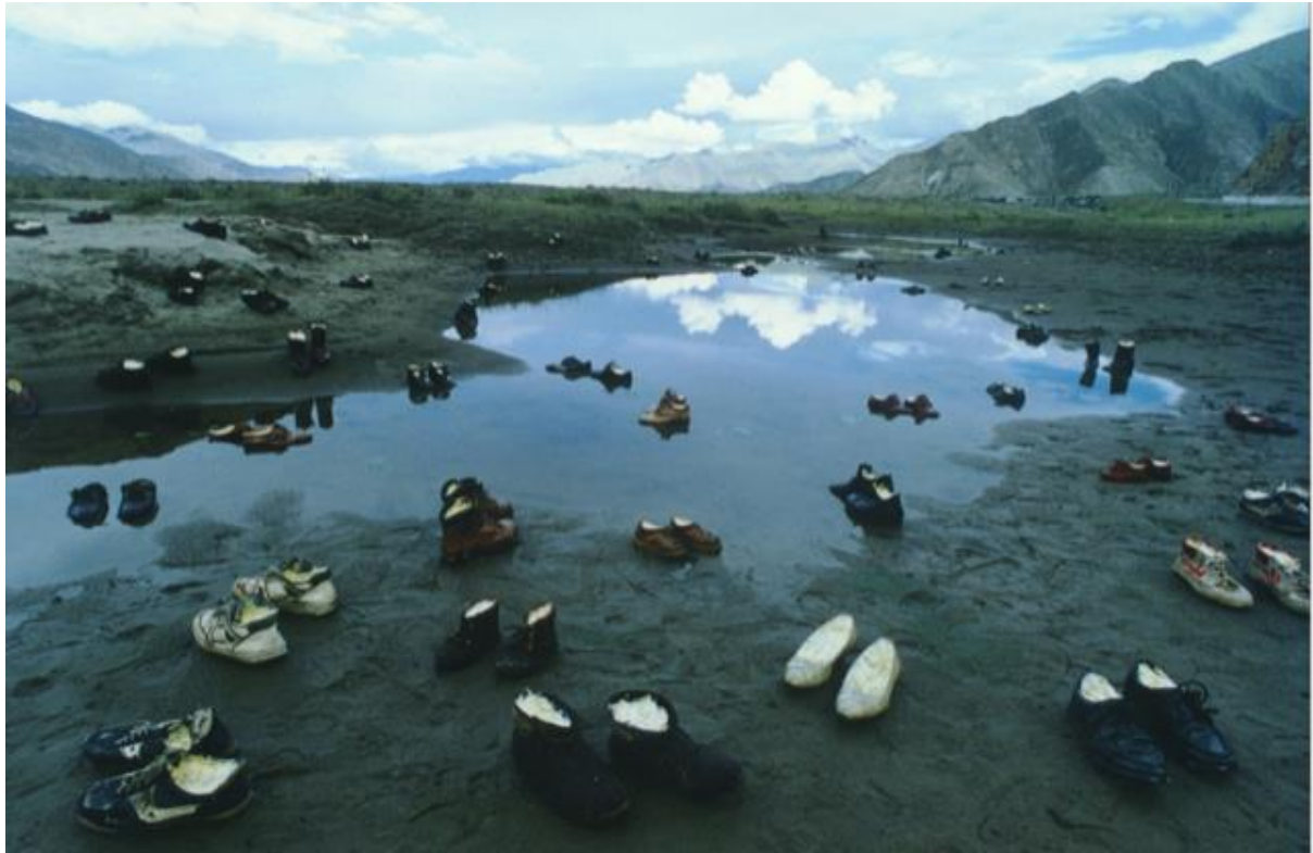
Yin Xiuzhen Shoes with Butter, Tibet-Lhasa , C-Print, 120 x 180 cm (1996).