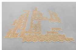
Diango Hernández, Melodia. Sand on wood 200 x 200 cm / 78 6/8 x 78 6/8 in (2018)