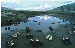
Yin Xiuzhen, Shoes with Butter, Tibet-Lhasa C-Print, 120 x 180 cm (1996)