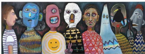
Oska Gutheil Me And Other Me, Öl auf Leinwand, 80 x 220 cm (2019). Abbildung © Oska Gutheil