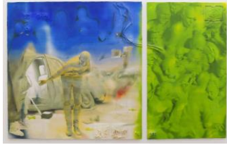
Simon Lehner, Safe Crash - revised. Acrylic on unique foam plate, lens based CNC Painting 200 x 320 x 10cm (2023)