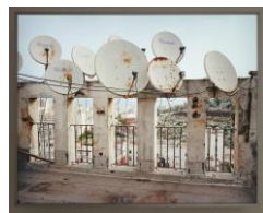
Kader Attia, Parabolic Self Poetry. Light box 128 x 159 x 20 cm / 50 3/8 x 62 5/8 x 7 7/8 in. Edition no.: 1/3 (2015)